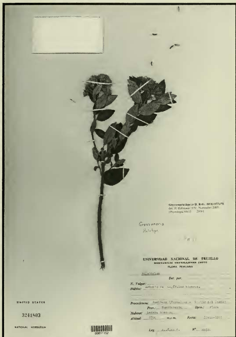
Fig. 1. Grosvenoria lopezii H. Robinson, holotype, United States National Herbarium (US).